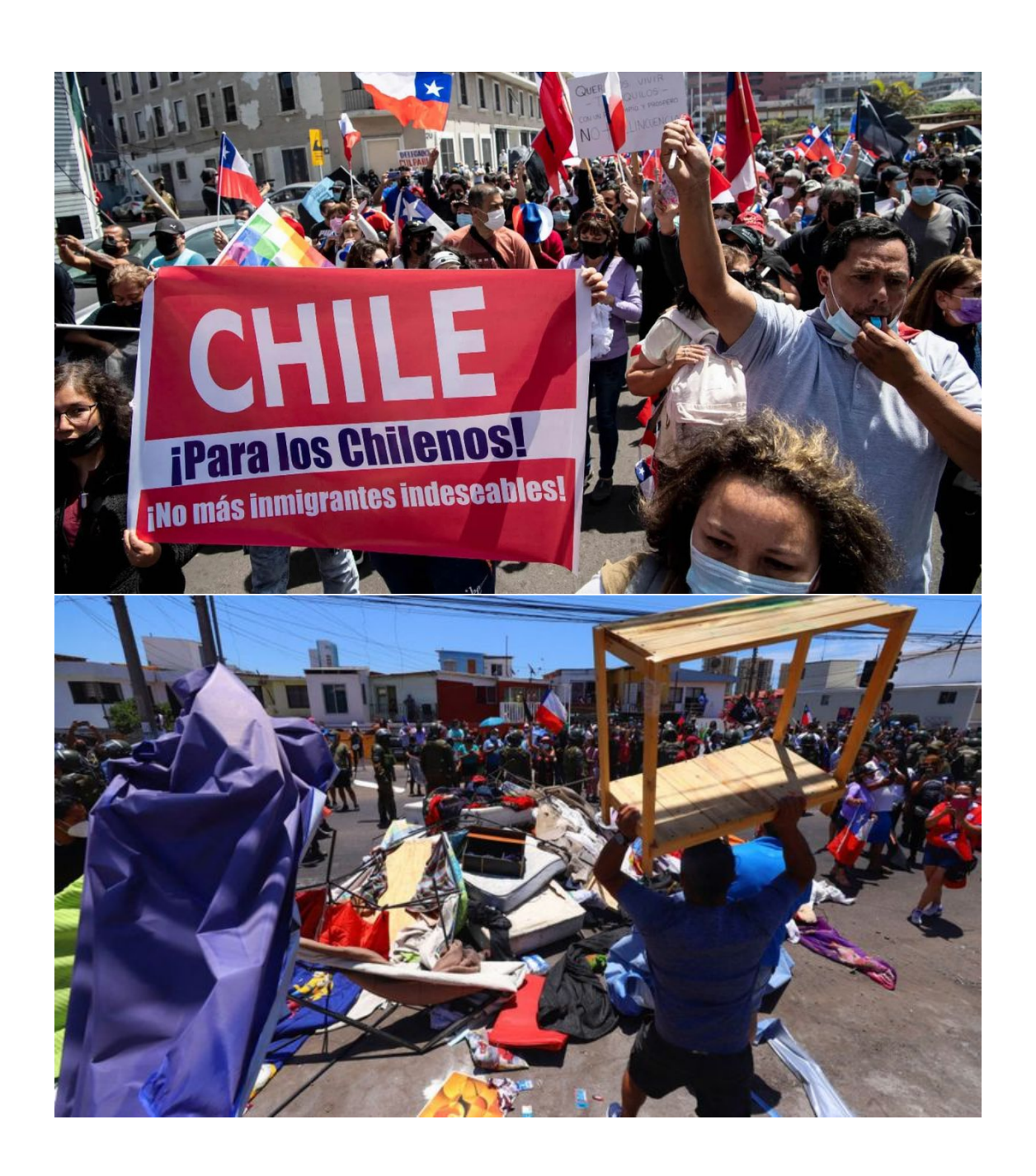
Figure 3: Anti-migrant protests and violence in Chile. Top: sign translates as "Chile for Chileans: No more unwanted immigrants". Bottom: protesters destroying the property of Venezuelan families living in a homeless camp.