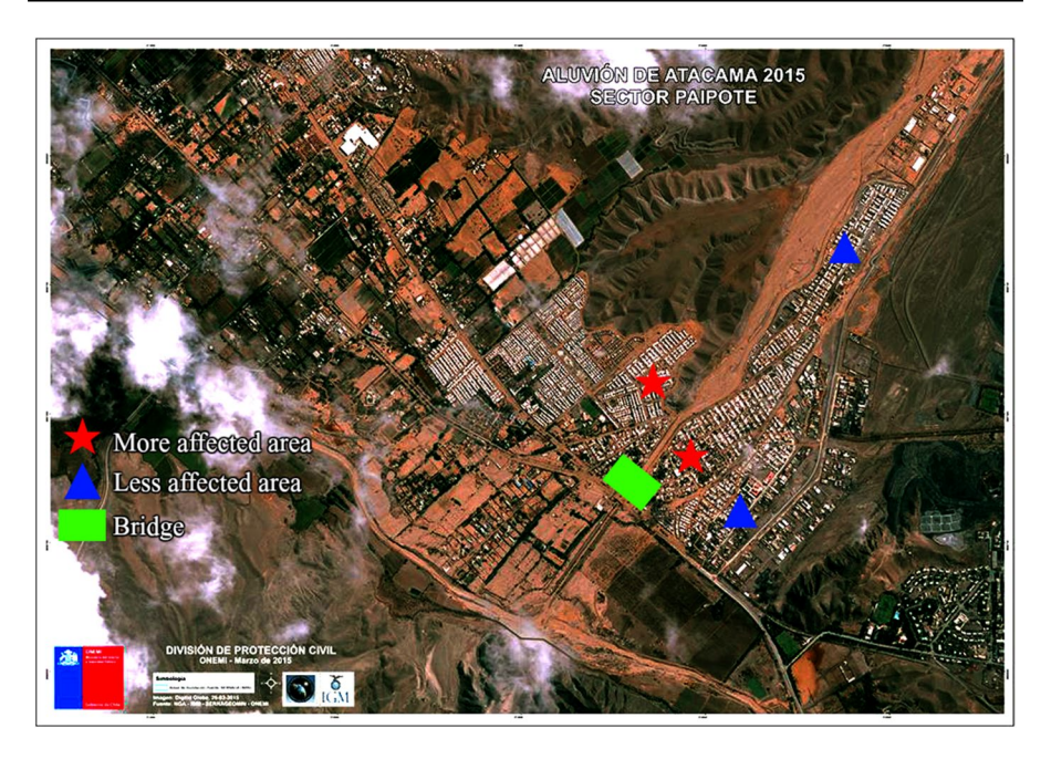
Fig. 1 Map of Paipote

Given that the attribute values were randomized, the design allows us to identify the effect of each attribute on the probability of being preferred as mayor. <sup>19</sup> This can be estimated by regressing the binary outcome (preferred or non-preferred) on the set of attributes for each profile. <sup>20</sup>